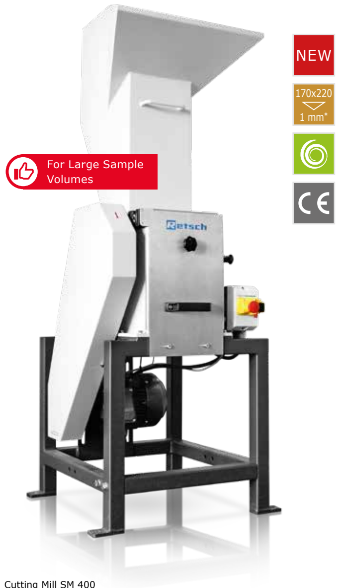
Cutting Mill SM 400