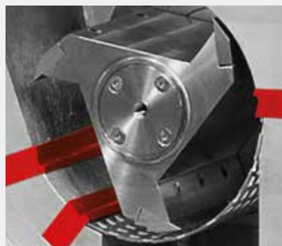
3 double acting cutting bars provide optimum cutting effects (SM 200 & SM 300)