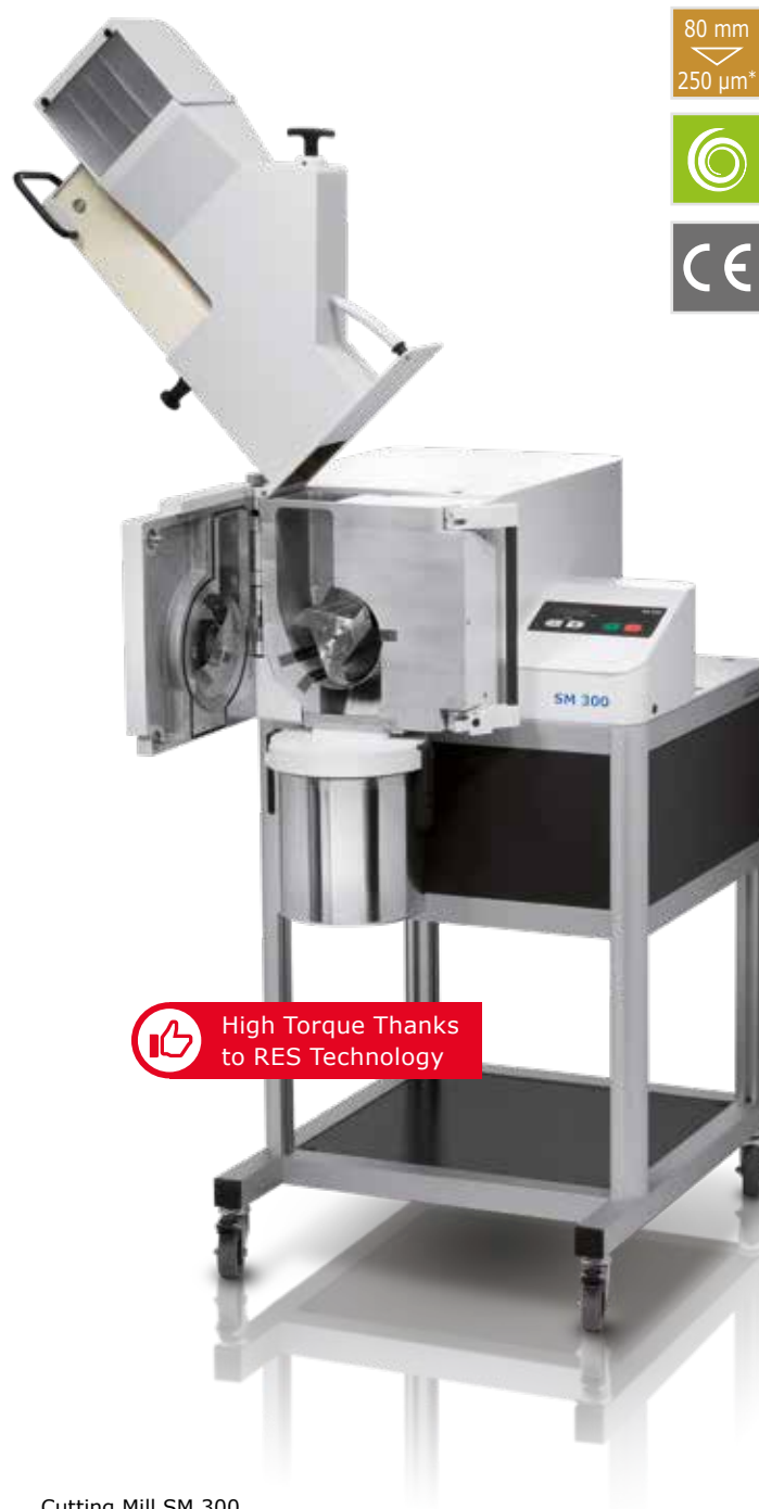
Cutting Mill SM 300