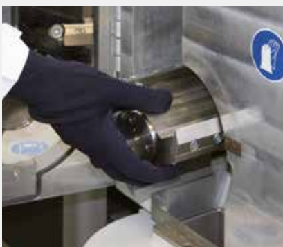
Push fit rotors facilitate quick and easy cleaning