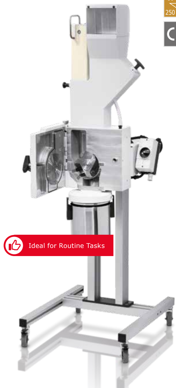
Cutting Mill SM 100 with optional base frame