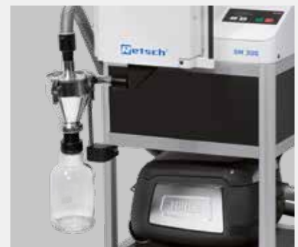
Cyclone-suction-combination ensures adequate cooling of sample and cutting tools (SM 200 & SM 300)